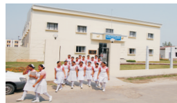
SRMS SCHOOL OF NURSING

E-mail : info@srmsims.ac.in • Website : www.srmsims.ac.in