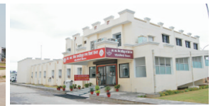
R.R. CANCER INSTITUTE & RESEARCH CENTER