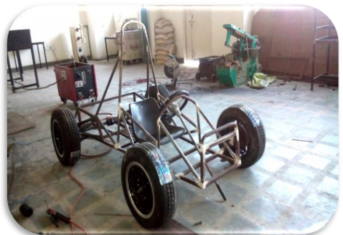
Image for Student Fabricated Car