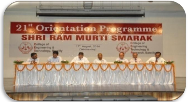
21 st Orientation Programme